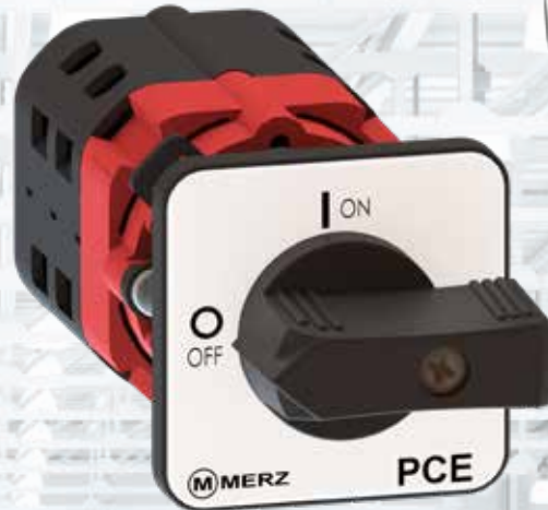
Series MN - Cam Switches