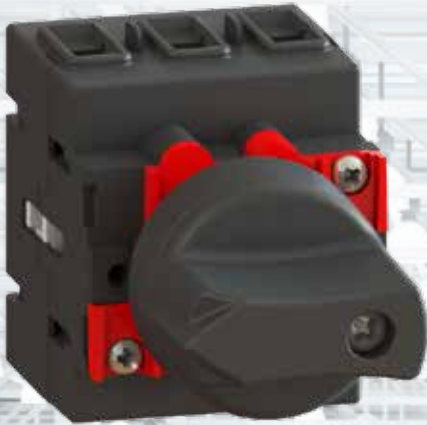
Series ML - Compact Switches