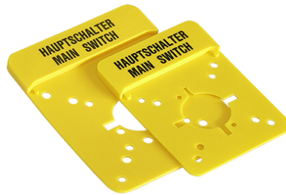
Zusatzfrontschilder Additional front plates