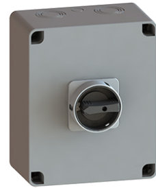
Gehäuse Serie 89xx Enclosures series 89xx