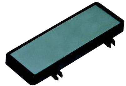
Schildträger Legend plate