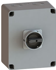
Gehäuse Serie 89xx Enclosures series 89xx