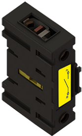
Schaltkontakt Switching contact