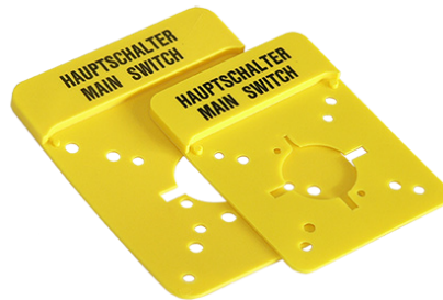
Zusatzfrontschilder Additional front plates