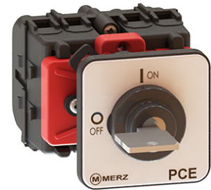
Schlüsselbetätigungen Key operation