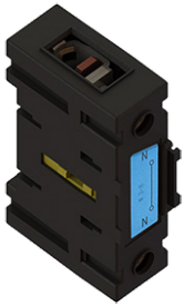
Neutralleiterkontakt Neutral switched