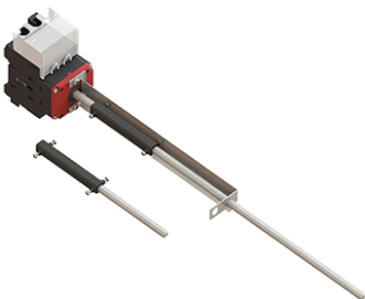
Achsverlängerung in Kombination mit Türkupplung Extension shafts in combination with door coupling