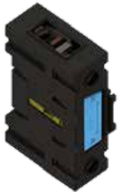
Neutralleiterkontakt Neutral switched