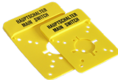
Zusatzfrontschilder Additional front plates