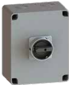
Gehäuse Serie 89xx Enclosures series 89xx