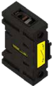
Schaltkontakt Switching contact