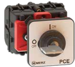
Schlüsselbetätigungen Key operation