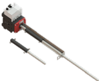
Achsverlängerung in Kombination mit Türkupplung Extension shafts in combination with door coupling