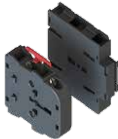
Hilfsschalter 1S + 1Ö Auxiliary contact 1NO + 1NC 2KL Anreihklemmen 2-polig 2KL Terminal 2-pole